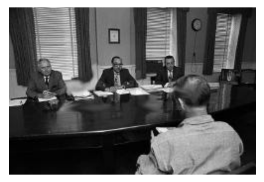
"Elderly Pilot Program" Cont...

(d) The court shall consider the petition in its entirety and may not order the release of the committed person if the court finds that the committed person poses a threat to public safety. If the court determines that a committed person is eligible for a sentence adjustment under this Section and determines that the committed person should receive a sentence adjustment the court shall set the conditions for the committed person's release from prison before the expiration of the committed person's sentence imposed by the sentencing court.